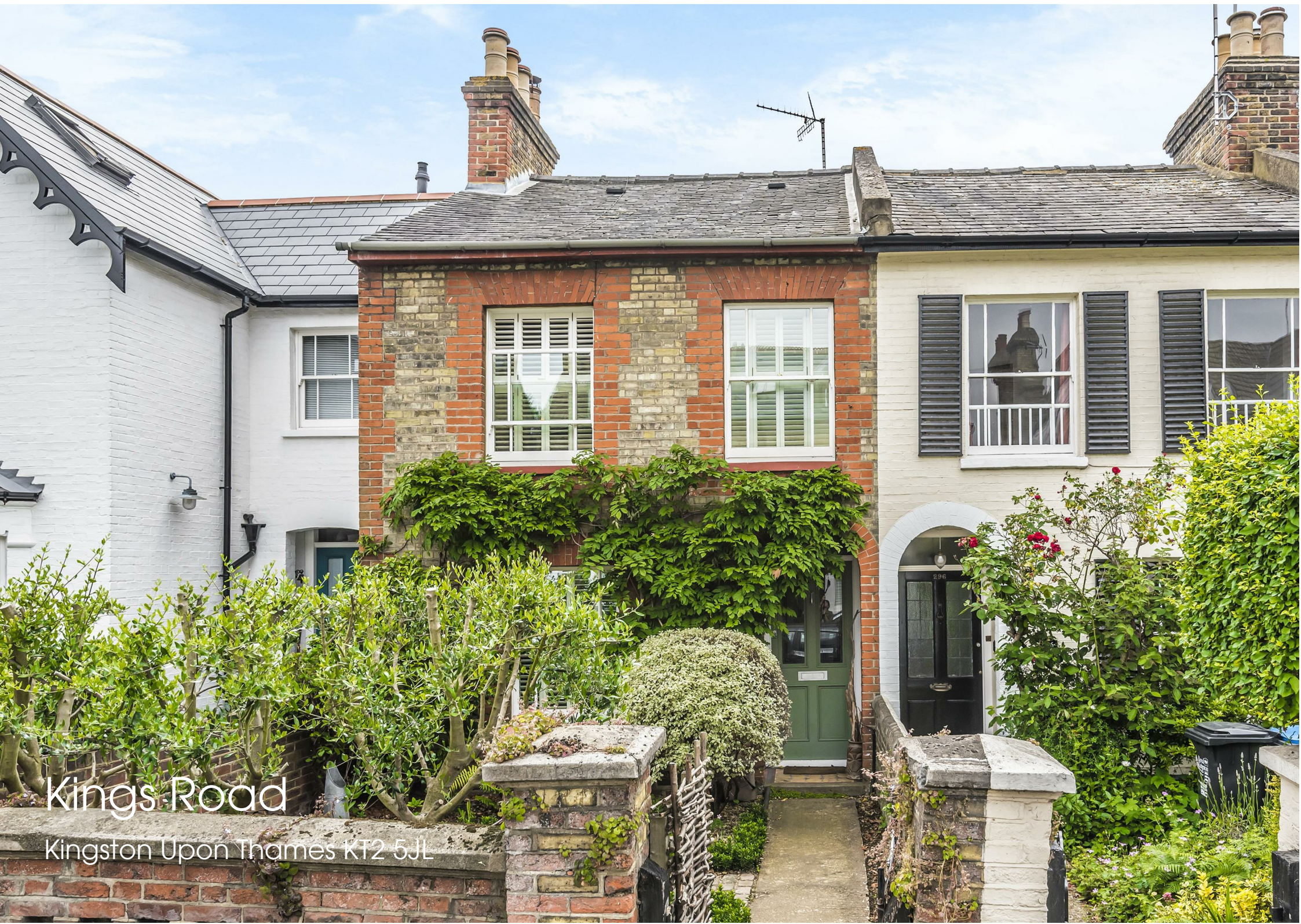
Kings Road Kingston Upon Thames KT2 5JL