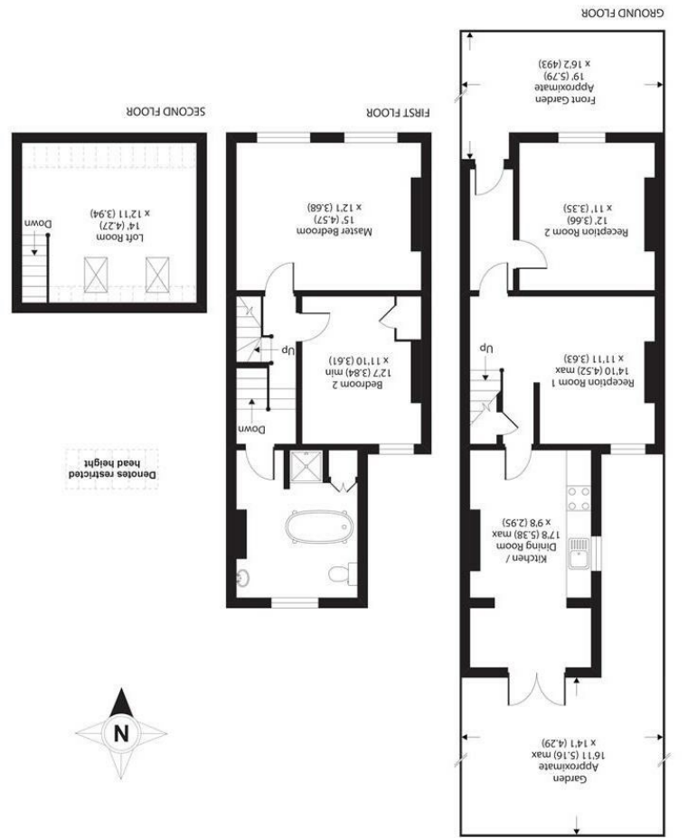
APPROX. GROSS INTERNAL FLOOR AREA 1211 SQ FT 112.5 SQ METRES (INCLUDES RESTRICTED HEAD HEIGHT)

34 Richmond Road Kingston upon Thames Surrey KT2 5ED www.gibsonlane.co.uk Tel: 020 8546 5444